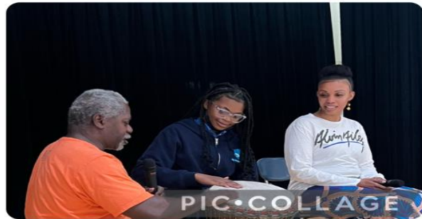
Alvin Ailey Partnership!